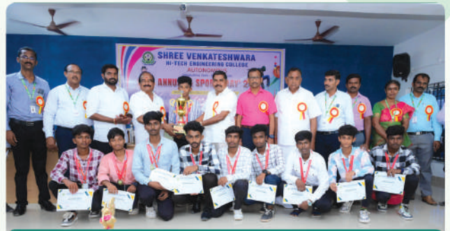
Annual & Sports Day - 2024