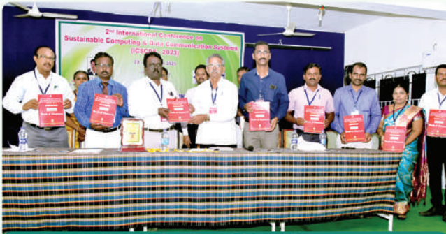
IEEE National Conference