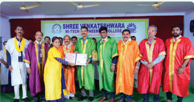
Graduation Day - 2024